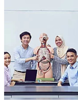
Pathway to the medical and health sciences undergraduate degrees offered by IMU.

( http://mansionsglobal.com/luxury-real-estate-news/celebrity-homes/?utm_source=nst&utm_campaign=recsys&utm_medium=recsys )