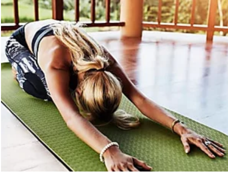
Chiropractors Stunned: Simple Stretch Relieves Years of Back Pain (Watch)