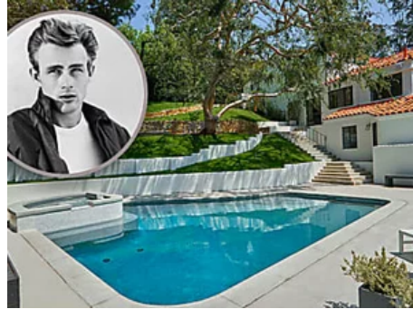
Celebrity Homes, Sales, Purchases, and More

( https://siteloading.com/path/lp.php?trvid=10210&trvx=9633b77a&caid=007cc7898f951f9e90fa9b62d6282973f&cid=90456a0f237b67abe2d2772b55da9031e&art=Chiropractors+Stunned+By+Simple+Stretch )