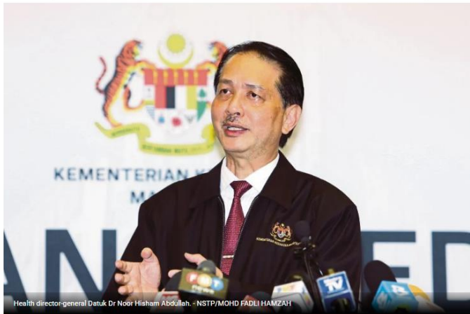
Health director-general Datuk Dr Noor Hisham Abdullah.