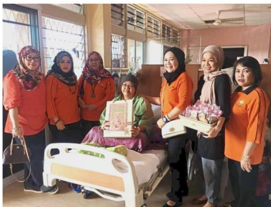
SFWI members posing with a patient after the visit.