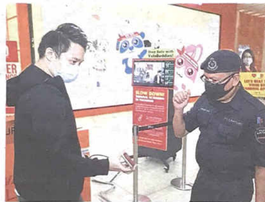
An auxiliary policeman ensuring that a visitor has scanned the QR code using the MySejahtera app before allowing him to enter a mall in Kuala Lumpur.

jahtera@nasca.gov.my along with details and screenshot pertaining to the issue.