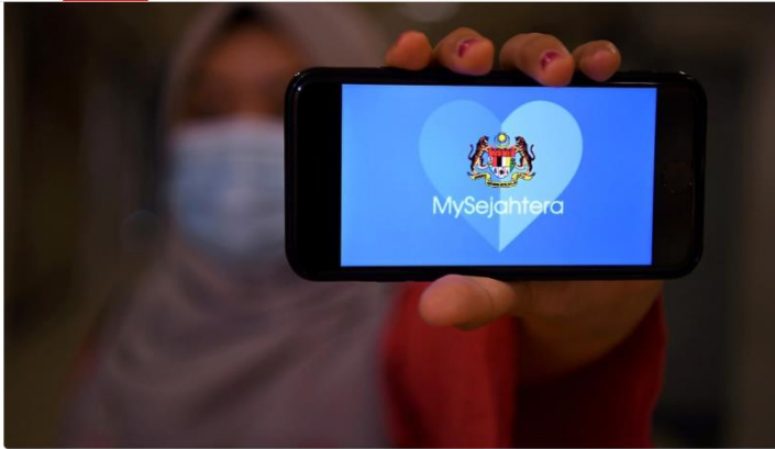
A woman holds up a phone displaying the MySejahtera app in Kuala Lumpur May 6, 2020.

Thursday, 19 Nov 2020 08:44 AM MYT BY IDA LIM